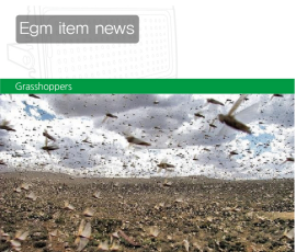
Grasshoppers, boasting a voracious appetite that is devastating to the extent that there is no grass around them, are moving from Africa to India and Pakistan to mainland China.

One of the most destructive pests on the planet the grasshopper is 6 to 7 cm long and weighs 2 g. It lays 300 eggs a year and breeds grasshoppers over 5 generations. This time, there are 400 billion grasshoppers.