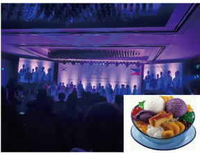
From 5 pm on October 26 and October 27, a cooking class is also available where you can experience and make your own 'Halo-halo', the national dessert of the Philippines.

Proceed with Philippine Tourism Department and Seodaemun Government. At this festival, you can see various cultural performances and taste traditional Filipino food. In addition, various events can be provided free of charge for anyone to participate.