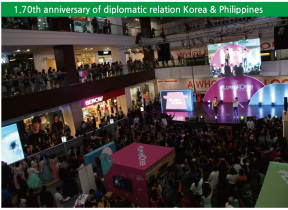
The Philippine Ministry of Tourism will hold the Philippine Cultural Festival "Feel the Phil" for three days from October 25 to October 27, in honor of the 70th anniversary of diplomatic relations between Korea and the Philippines.

Proceed with Philippine Tourism Department and Seodaemun Government. At this festival, you can see various cultural performances and taste traditional Filipino food. In addition, various events can be provided free of charge for anyone to participate.