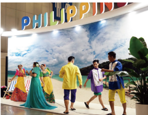
In addition, a photo exhibition and a 3D ART photo zone will be provided for visitors to see the local image of the Philippines.