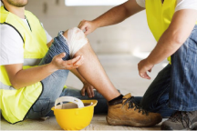
According to the BBC, at least 18 workers died during the construction period, also referred to locally as the Bridge of Death.

Using this bridge, the road trip between Hong Kong and Macau is reduced from 3 hours to 30 minutes. About 30 kilometers from China to Hong Kong is an offshore bridge and about 7 kilometers is an undersea tunnel.