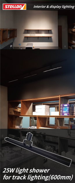
25W light shower for track lighting