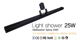
Light shower 25W (Wallwasher lighting 25W) It is perfectly suitable for display lighting