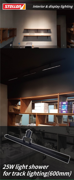
25W light shower for track lighting