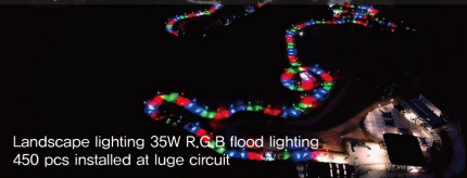
Landscape lighting 35W R,G,B flood lighting 450 pcs installed at luge circuit

35W landscape lighting RGB flood lighting Dimming & Control test